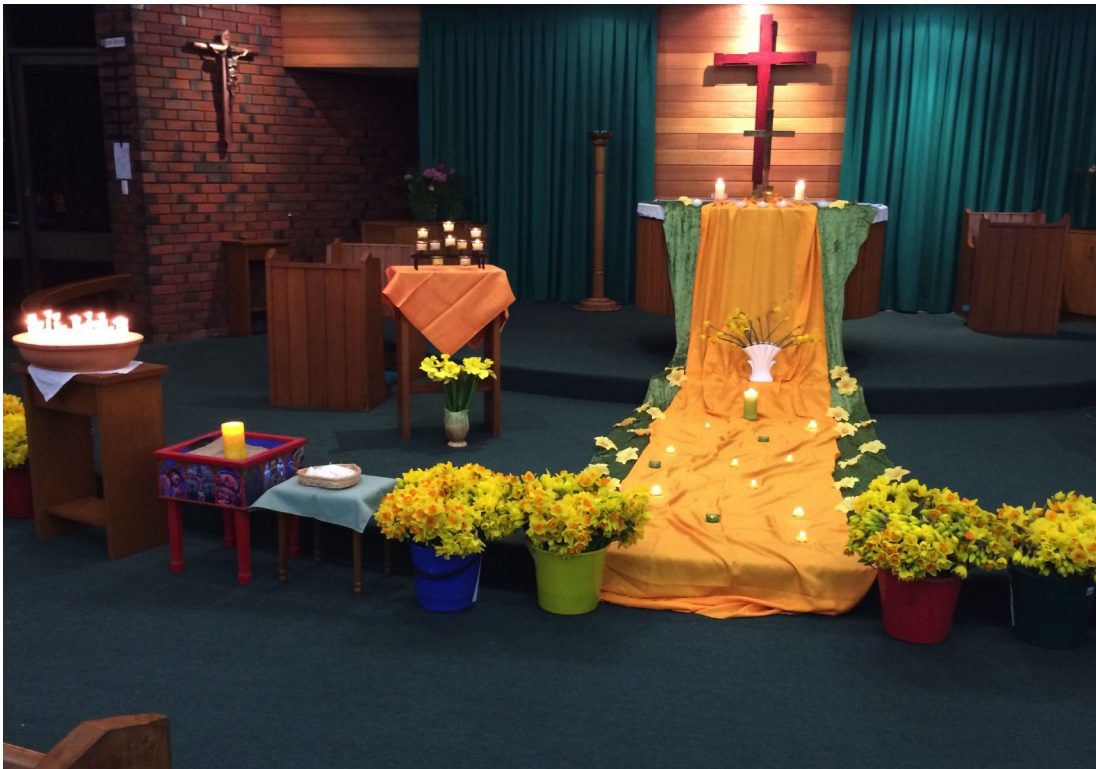
Ready for the recent Daffodil Day Service

Daffodil Day Service, Blue Christmas Service Monthly Taize Service Blessing of the animals Migrant and Refugee Sunday Launch of the Christmas Bowl Seniors week